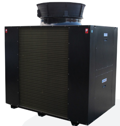
Axitop is optional

Experience the best in water chiller technology