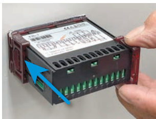
Figure 7: With one hand pressing firmly on the face of the controller, push the ratchet clips and tighten the seal.