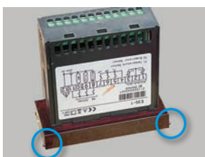
Figure 4: Place frame onto controller and move towards the LED display. Dimples circled must be to the front and top of the controller.