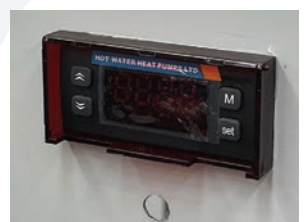
Figure 6: Push controller into the hole. Silicone will seal against mounting surface.