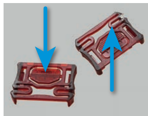
Figure 2: Ratchet clips. Press down where arrow is pointing to release.