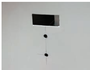
Figure 1: Cutout for E35 Controller.