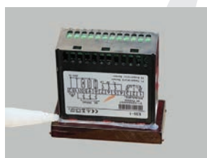
Figure 5: Apply silicone around the frame as shown.